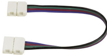
2 Metre Grip Double End Connector