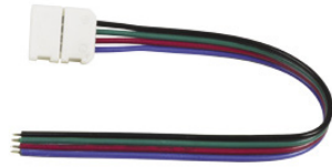
2 Metre Grip Single End Connector