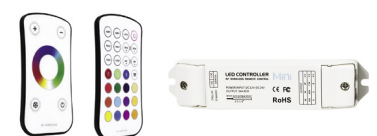
RF RGB Controller Kit & RF Button Controller Kit